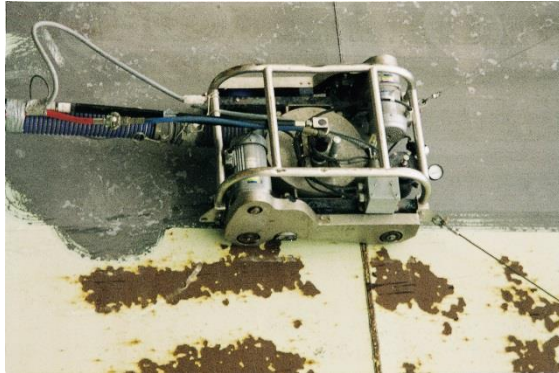
Figure 4. Ultra-high pressure water jetting of steel barrier gates.