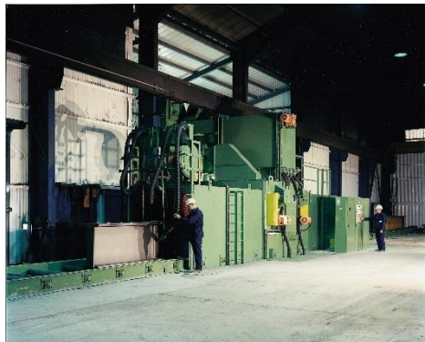
Figure 1. Automatic shot blast plant.

By far the most significant and important method used for the thorough cleaning of mill-scaled and rusted surfaces is abrasive blast cleaning. This method involves mechanical cleaning by the continuous impact of abrasive particles at high velocities on to the steel surface either in a jet stream of compressed air or by centrifugal impellers. The latter method requires large stationary equipment fitted with radial bladed wheels onto which the abrasive is fed. As the wheels revolve at high speed, the abrasive is thrown onto the steel surface, the force of impact being determined by the size of the wheels and their radial velocity. Modern facilities of this type use several wheels, typically 4 to 8, configured to treat all the surfaces of the steel being cleaned. The abrasives are recycled with separator screens to remove fine particles. This process can be 100% efficient in the removal of mill scale and rust.