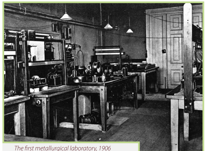
The first metallurgical laboratory, 1906

Between 2018 and 2021, Bushy House underwent extensive repairs and restoration work to the main property and garden buildings.