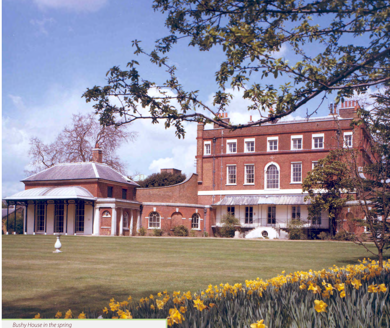
Bushy House in the spring

In 1789 he was made Duke of Clarence which effectively ended his naval career and from then onwards he led a fairly pointless existence until he met and fell in love with the famous actress Mrs. Dorothea (sometimes known as Dorothy or Dora) Jordan in about 1790. In 1797, the King offered him Bushy House recognising and accepting that William was already living with Dorothy. They often entertained the Duke's brothers at Bushy and for William's 41st birthday, a wonderful reception was organised attended, it is said, by all his brothers, the pretenders to the throne, and all quite drunk.