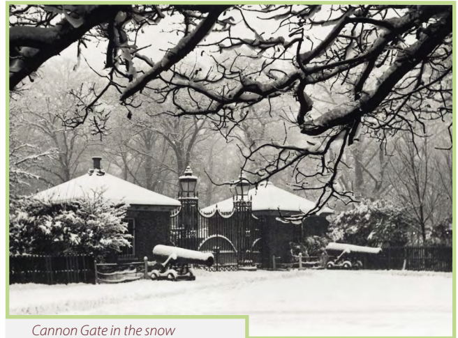
Cannon Gate in the snow

In 1901, work began on converting the ground floor and basement of Bushy House into a physics laboratory. Other parts of the building were arranged as temporary laboratories for electrical, magnetic and thermometric work, in addition to metallurgical and chemical research. The second floor and some of the first floor were set aside as a private residence for Glazebrook and his family.